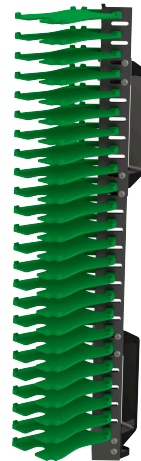
Hotel 24 – Portrait