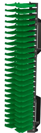
Hotel 24 – Landscape

For more information contact (858) 880-7376 or info@biosero.com www.Biosero.com